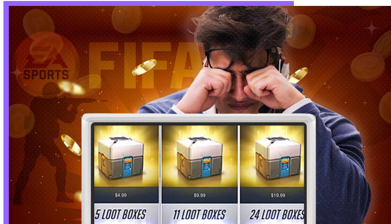
Loot boxes in FIFA

Loot boxes are a type of monetization strategy where the players can buy a collection of in-game digital goods and services together. By purchasing a virtual loot box, players can get randomized goods. Example: "Overwatch" offers loot boxes, which consist of skins, emotes, and voice lines.